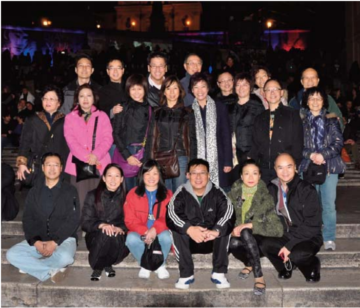
First night group photo at the Spanish Steps, Rome