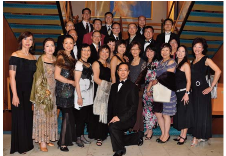
Formal night at Sea