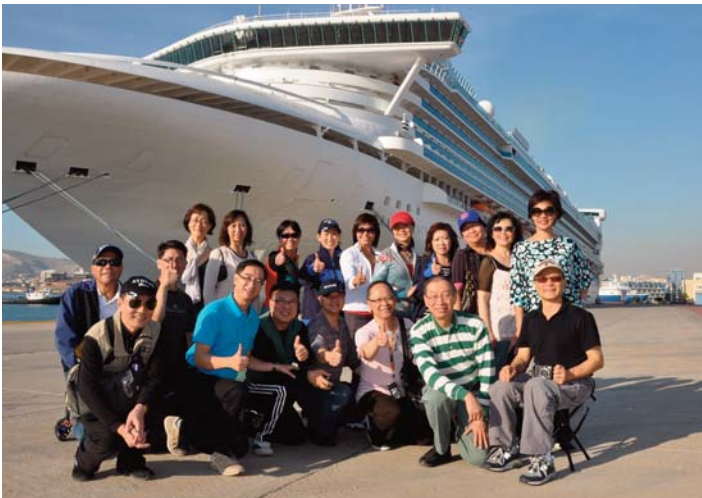
Gangs at the port of Athens, Greece

which was closest to a semi-circle in shape with a long line of about 30 feet along the width of the raised stage and about 20 feet deep in the centre. We had fun dancing all 5 Standard Dances on this floor and were the source of amusement to the "audience" when it seems some of us were appearing to crash but managed to dance around each other the last second. The dancing carried over to another "ship" where we had dinner on a Nile Cruise in Cairo, as many of us men could not refuse being dragged onto the stage by the beautiful