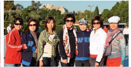
Girls in Athens, Greece