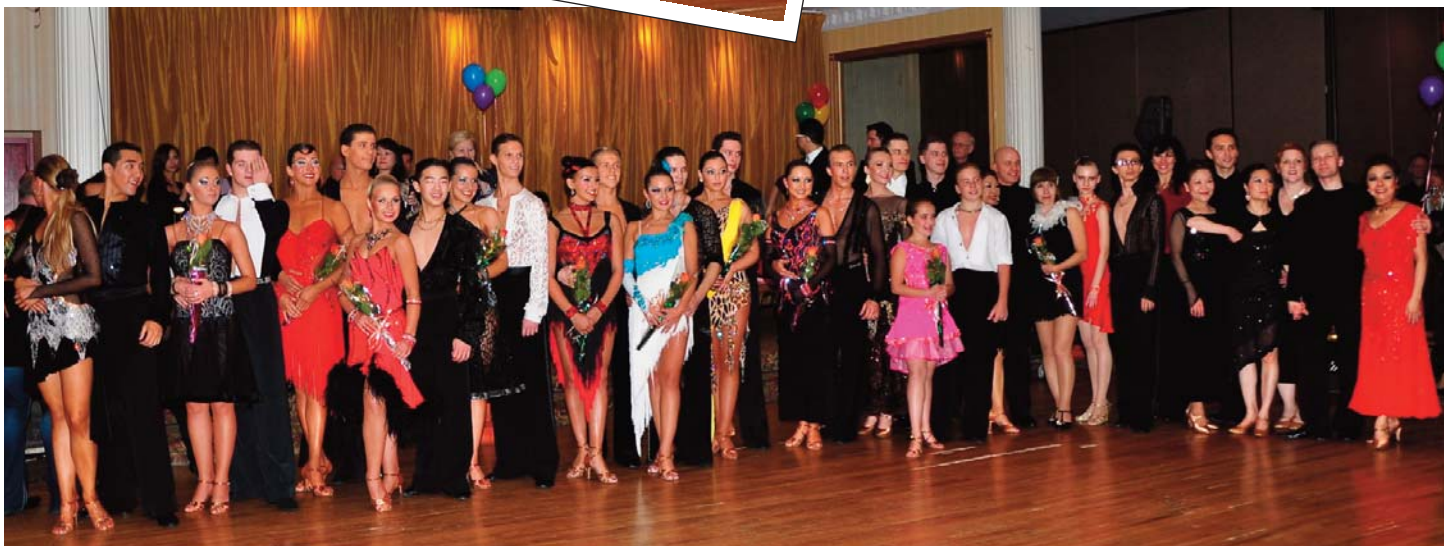
Group photo for all dancers