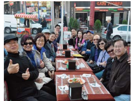
Lunch in Istanbul, Turkey

Back in November 2009, a group of 27 dance friends took some time off from our dancing at home in greater Toronto and went on a Mediterranean Cruise together which started from Rome, and finishing in Egypt as our last port of call where we danced in the Sahara Desert and rode a camel around the Great Pyramids outside Cairo. Well, to our true calling, we did dance as much as possible on the Grand Princess, our floating home for 12 days. The biggest floor we had to practice our floor craft on was a lounge stage floor