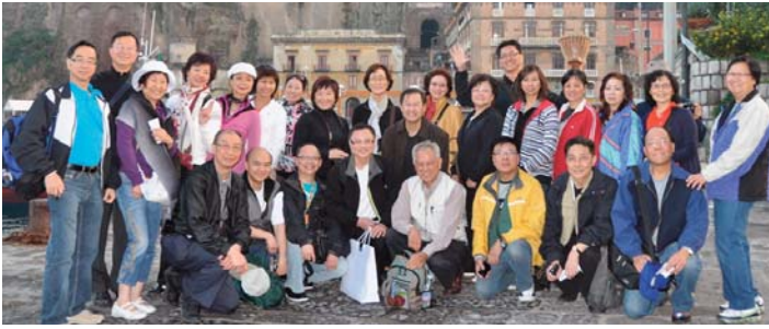
Group photo in Sorrento, Italy