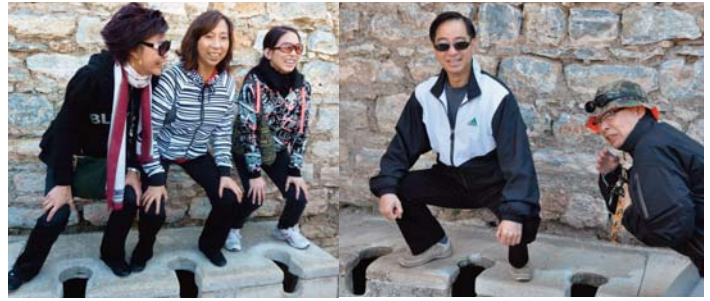
Try out for the ancient public toilet in Ephesus, Turkey