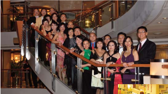
First formal nigh at Sea