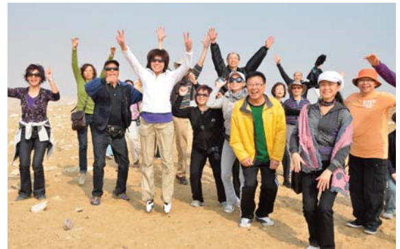
Joyful moment in Sahara Desert, Egypt